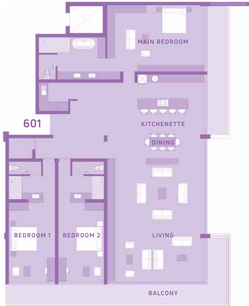
BLUEBERRY HILL BUSINESS HOTEL